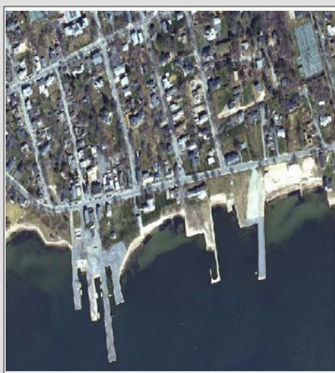
Town Brook discharge at Mattapoisett Harbor