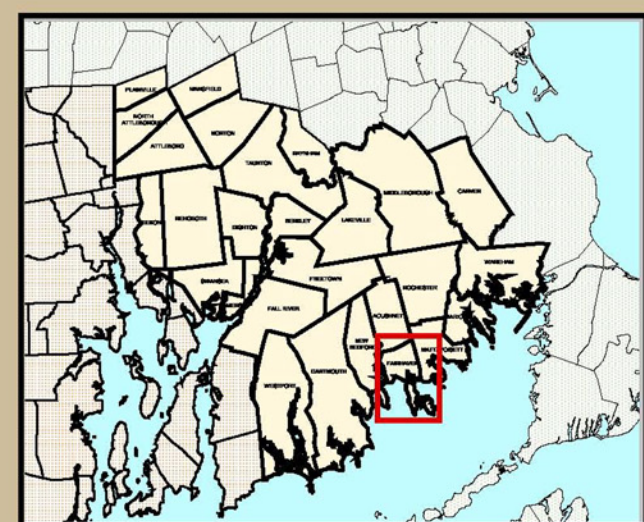
Inset of Town Location