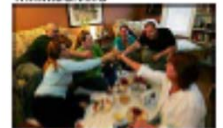
The displaced still celebrate