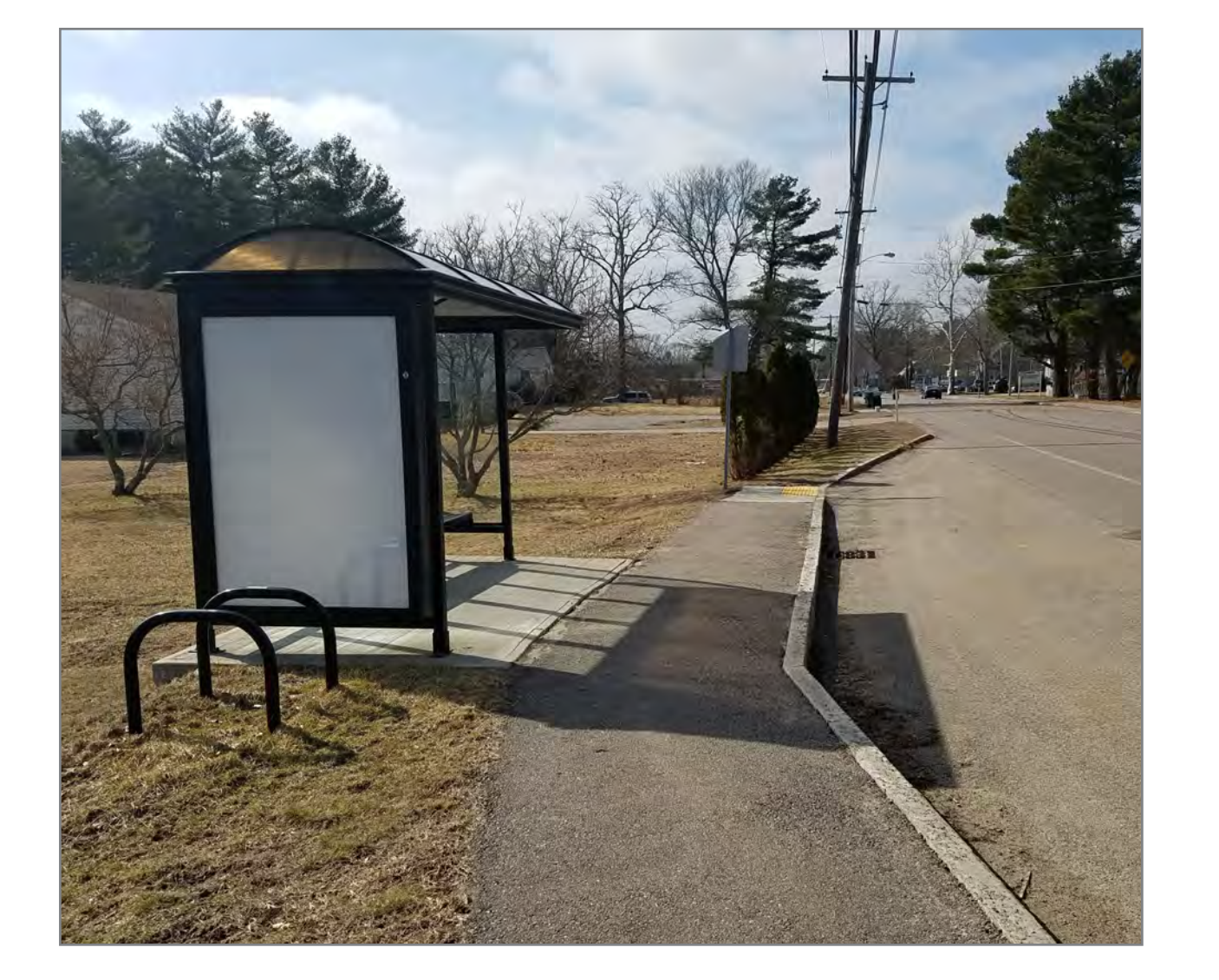
And much more!