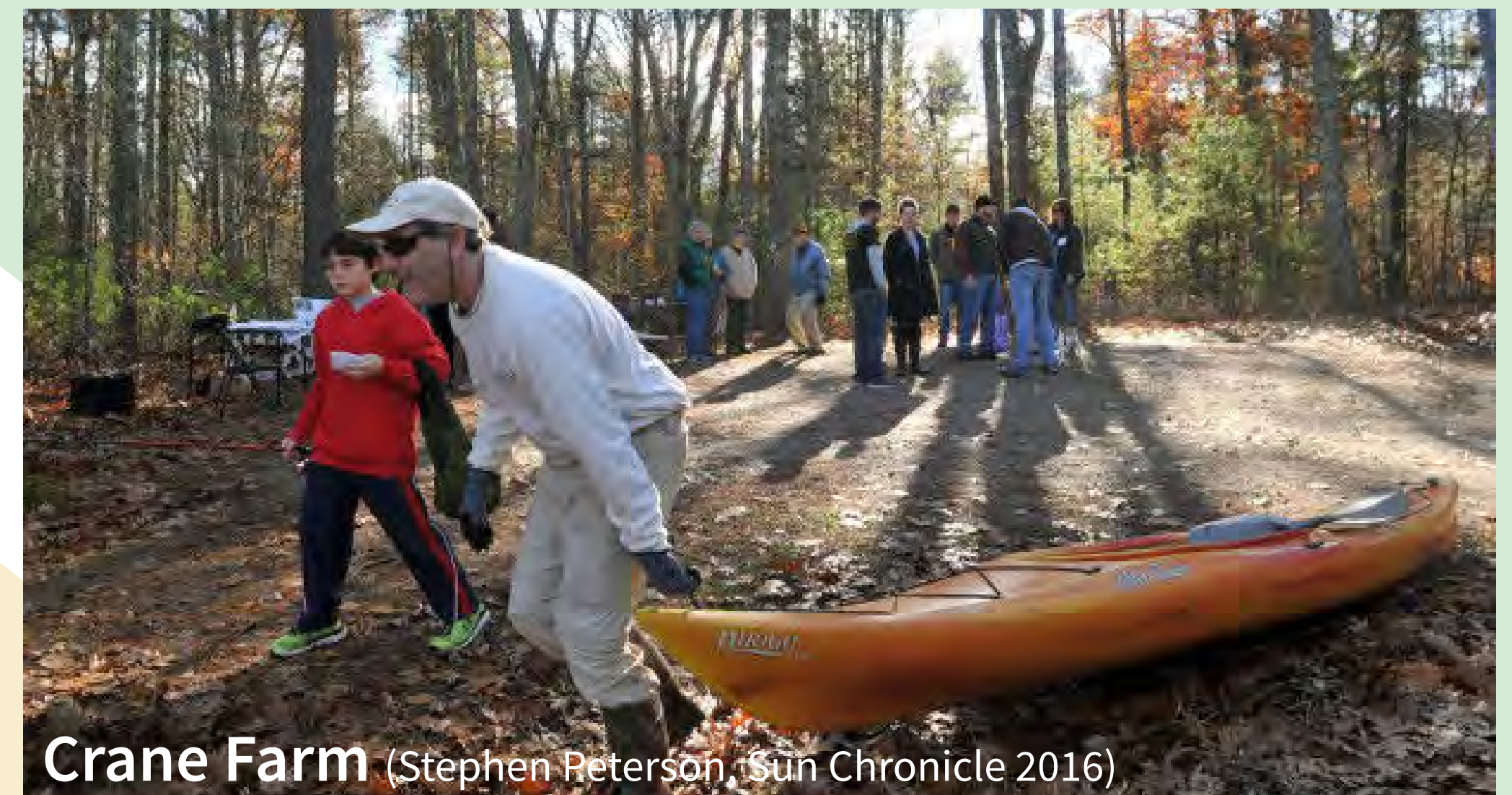
Crane Farm